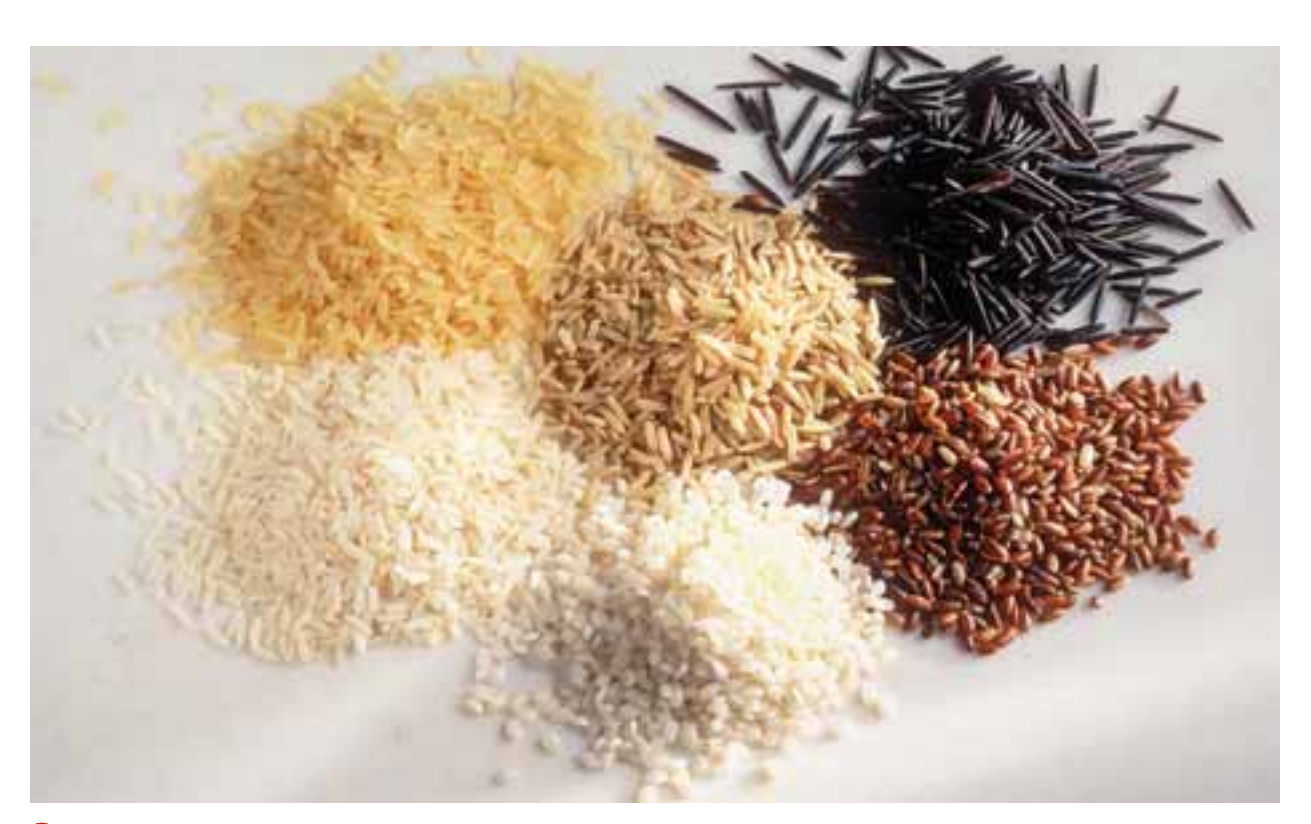
Rice Grains Pictured here are different grain types of rice. How do rice grain types differ?